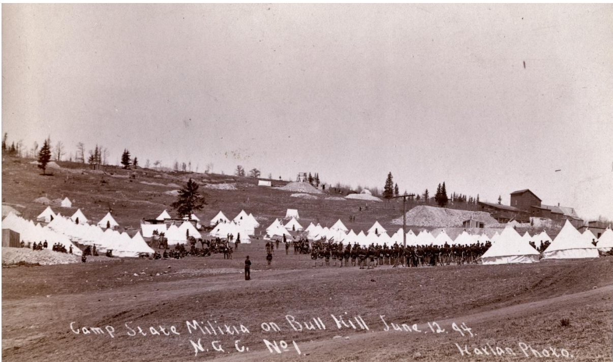
Figure 2. Encampment of state militia on Bull Hill, Cripple Creek Mining District, June 12, 1894. Cripple Creek was the site of two labor conflicts: the first in 1894 and the second one in 1903-1904.