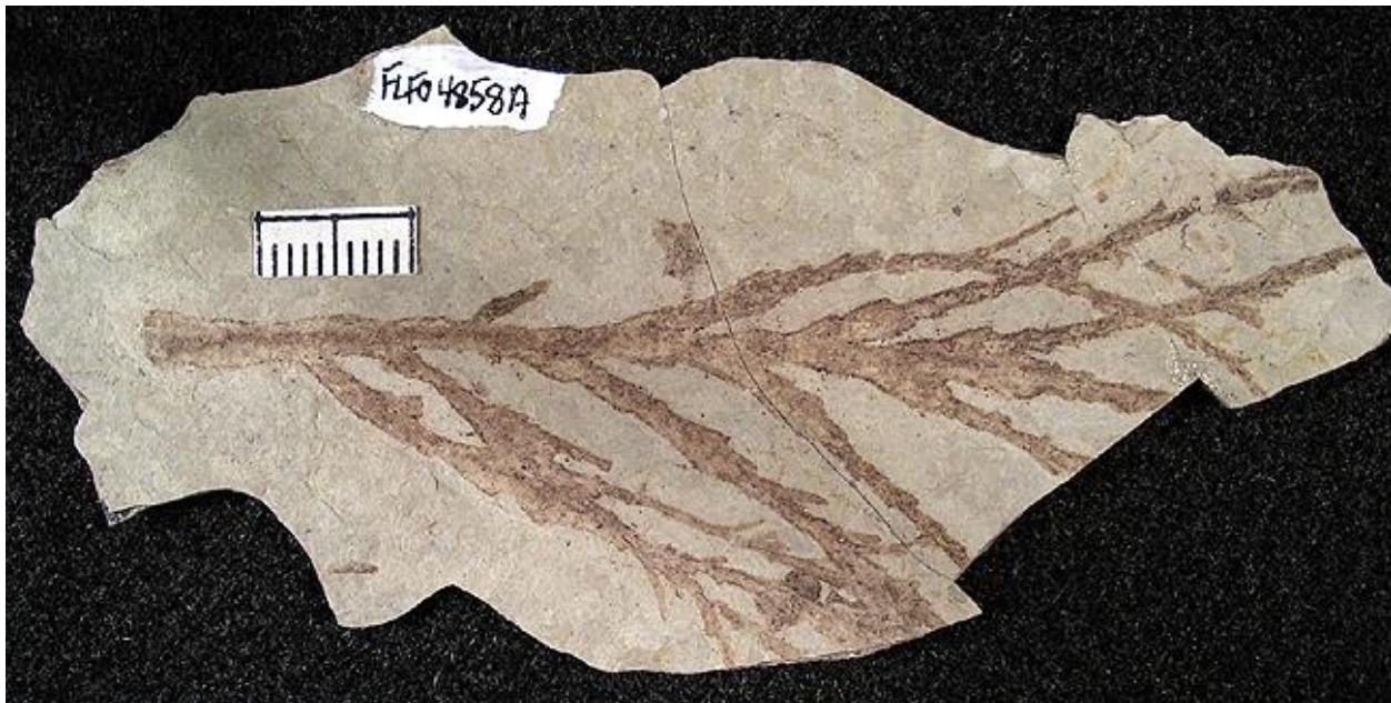
Fossil branches of the Florissant redwood, Sequoia affinis . Specimen FLFO-4858 from the collection of Florissant Fossil Beds National Monument. Image date Oct 2003 by S. Veatch.